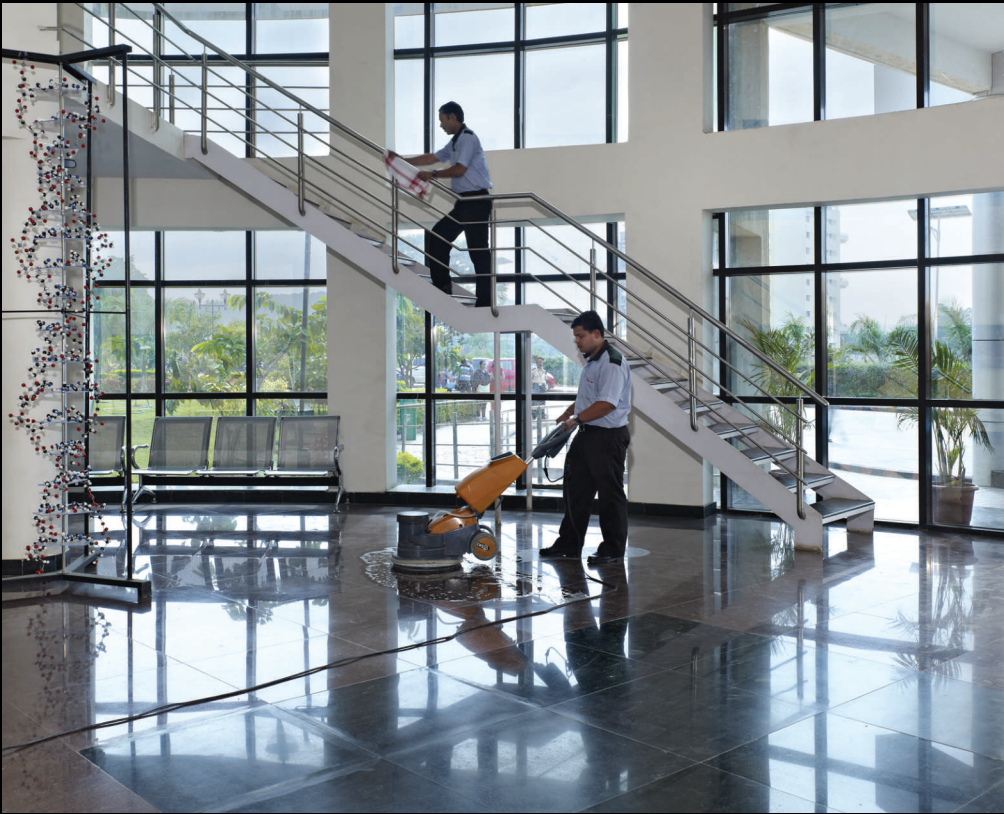
Mechanised Housekeeping Services